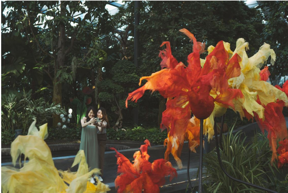
Canopy Park explodes with colour and eye-catching floral installations. Clockwise L-R: Hedge Maze: A Maze of Sunshine, Foggy Bowls: Blooming in Love, Source Pool: Swimming in Harmony.

Get lost in a sunflower maze bursting with a sea of over 3,000 cheerful blooms and 70 towering sunflowers at Hedge Maze: A Maze of Sunshine . For a touch of whimsy, navigate the Mirror Maze: Tranquil Blossoms that is adorned with 1,000 cascading pink, purple, and white wisterias, creating a mesmerising kaleidoscope effect. Keep your eyes peeled for a touch of surprise at Topiary Walk: Bloomventure . An abandoned jeep and giant animatronic Venus fly-traps lurking around every bend, add a rustic touch to the exploration. Romance fills the air at Foggy Bowls: Blooming in Love with over 80 lighted paper and kinetic flowers dancing in the gentle mist, creating a captivating spectacle. Fluttery butterflies (some even kinetic!) measuring up to 1.7 metres in height add to the enchanting atmosphere. Seek serenity at Source Pool: Swimming in Harmony , a tranquil display that features nine larger-than-life goldfishes swimming among live water plants on a misty pond.