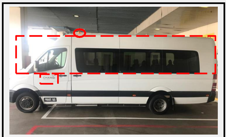
Vehicle (Side 2)