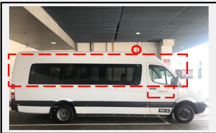
Vehicle (Side 1)