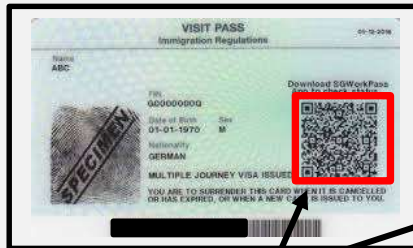
Work Permit (Back)