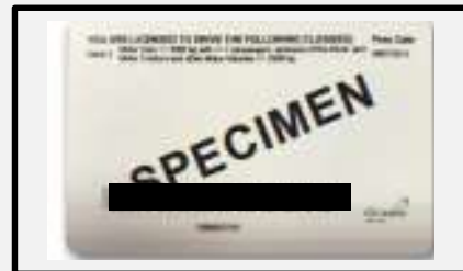
Airfield Driving Permit (Back)