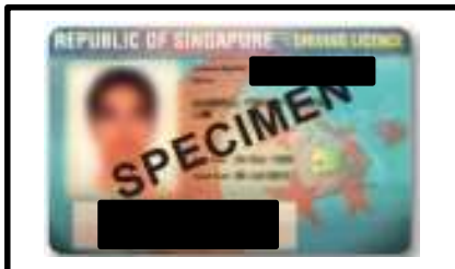
State Driving License (Front)