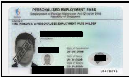
Work Permit (Front)