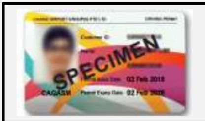
Airfield Driving Permit (Front)